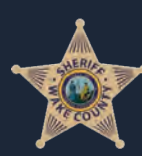
Wake County PD